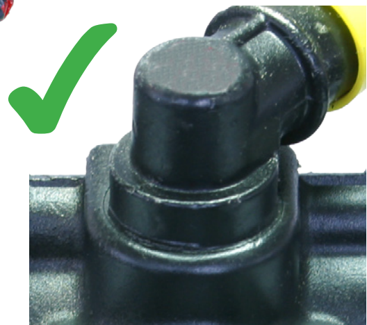
No turned inlet, no problem