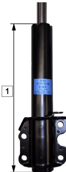
Fig. 1: Front axle

Item no.: 124 654, 290 377, 290 378, 290 379, 290 403, 290 955