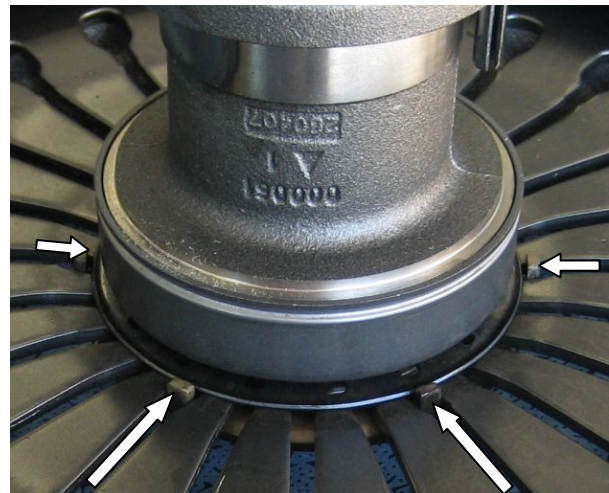
Fig. 3: Side view of guide tabs (only four of the total of six tabs are visible!)