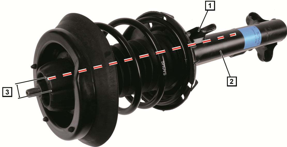
Fig. 1: Suspension strut

Mercedes-Benz C-Class (CL203 / S203 / W203) Mercedes-Benz CLK-Class (A209 / C209) Item no. 802 251