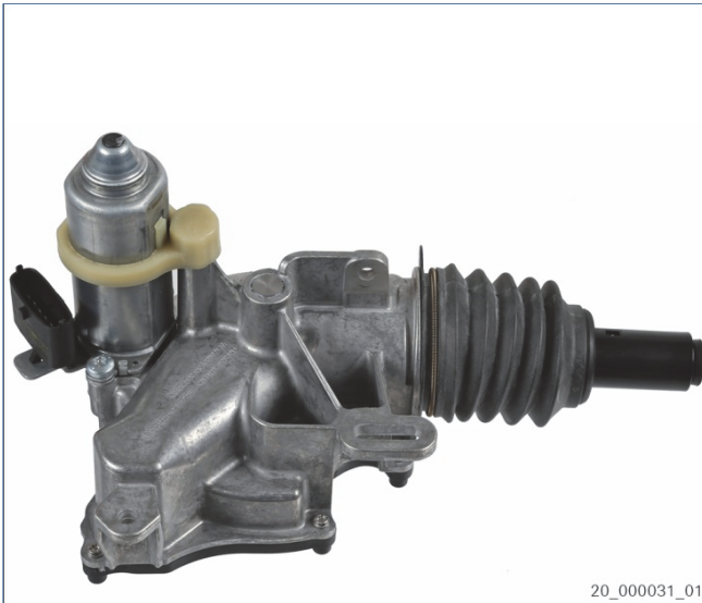
Fig. 1: Clutch actuator (example)