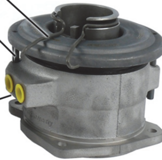
Fig.2: CSC MAN / Steyr