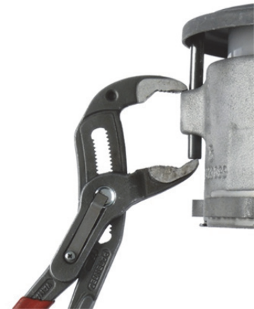
Fig.3: Adjusting the grooved pins