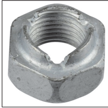
Fig. 2: Nut M14x1.5 with chemical threadlocker