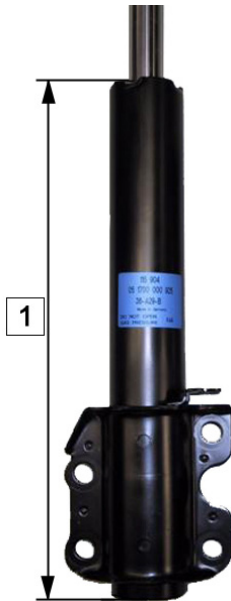
Fig. 1: Front axle

Item no.: 32-H60-0, 32-H61-0, 32-H62-0, 32-H63-0, 32-G71-0, 32-H81-0